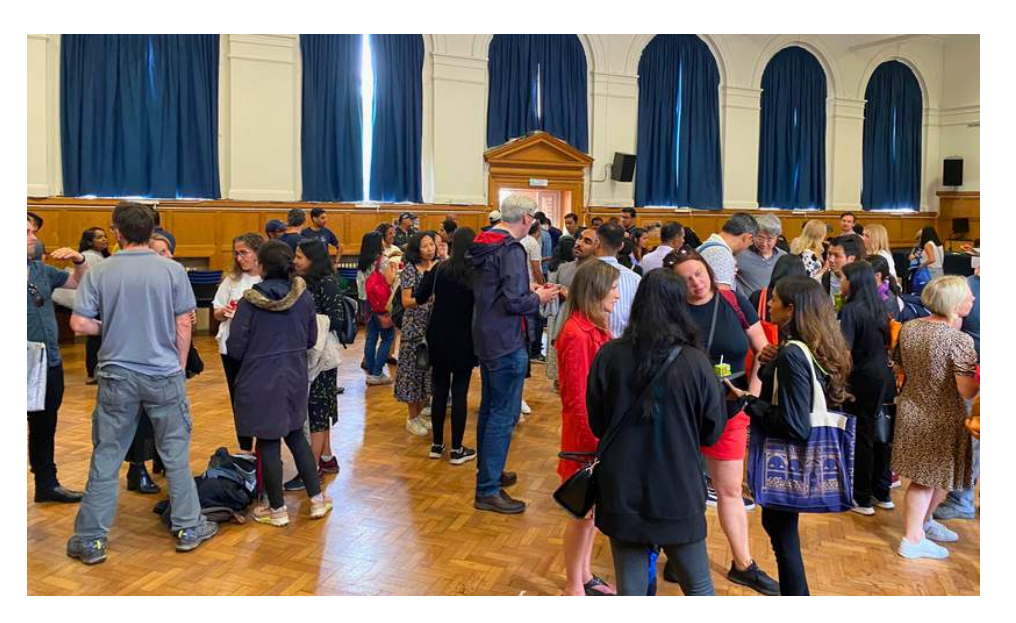
Above - Year 7 Parents and Carers mixed with each other in the main school hall and in the Quad area when it stopped raining