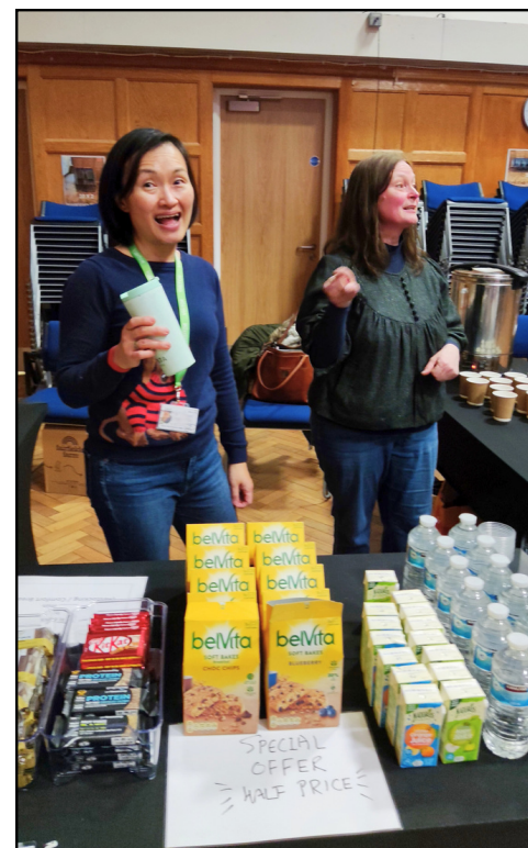
Above: Volunteers running the PTA refreshment stall at school event